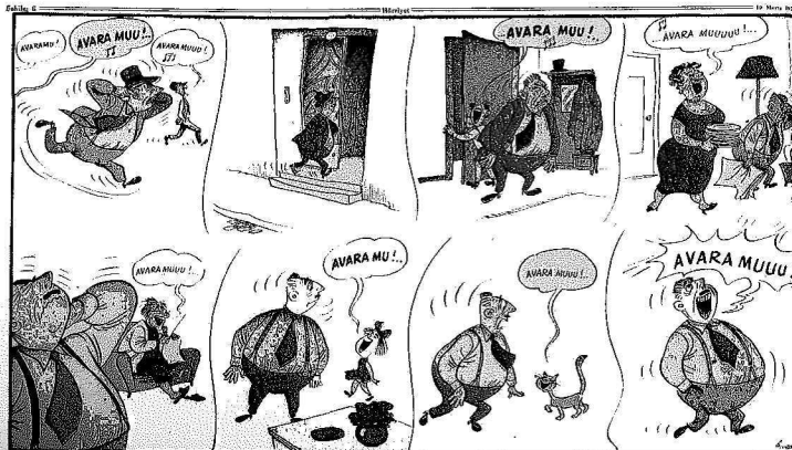
Taş Devri, Tunç Devri, Avara mu Devri...

1 Cartoons in the Turkish press of the 1950s, lampooning Avare .