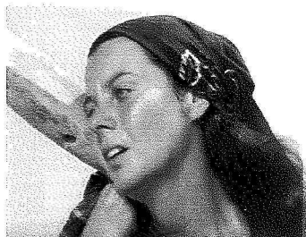
5 Turkish star Fatma Girik as Mother Earth in the 1973 remake of Mother India .

There are also some extra dialogues aimed at explaining certain situations and motives. For example, when his father leaves home, Murat (Birjoo) says: “My father